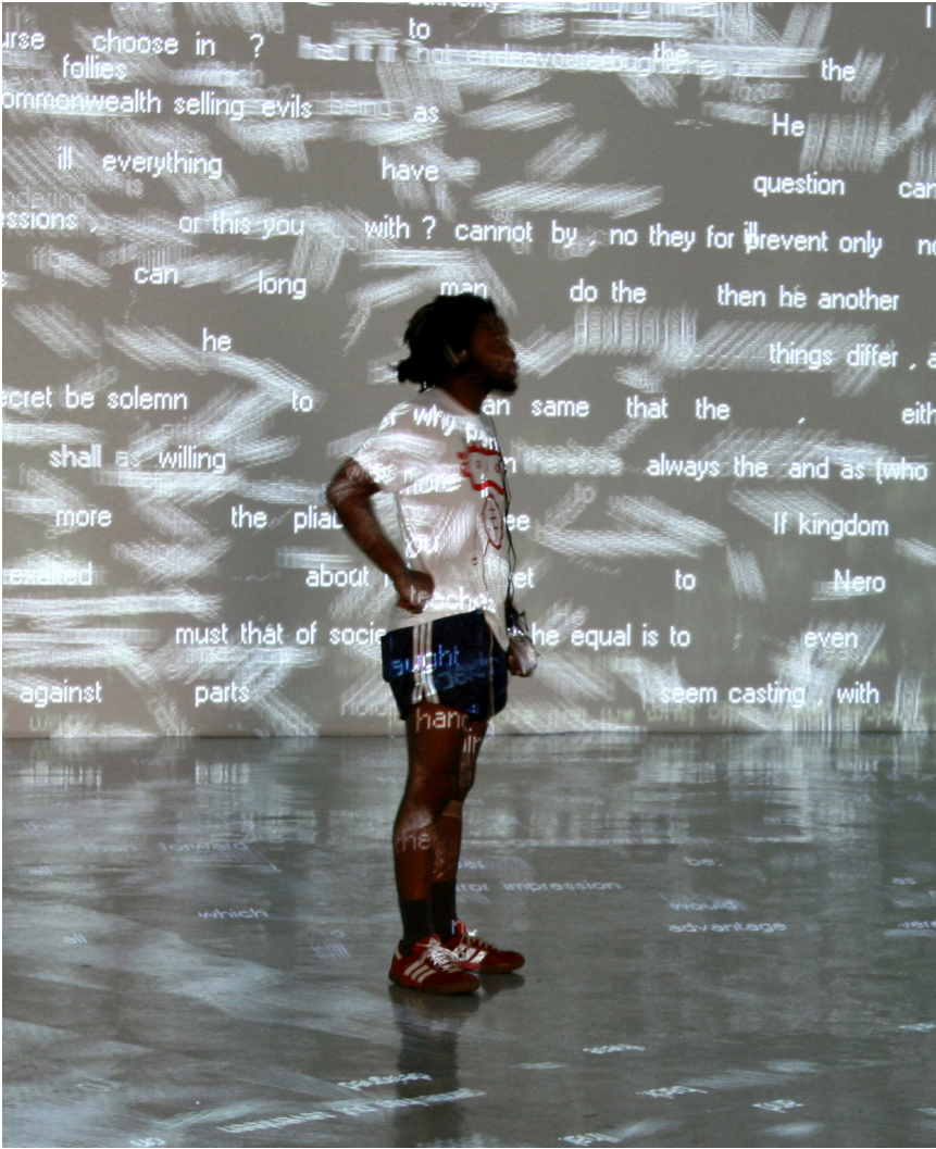
Charles Sandison, Utopia , 2006. Installation. Copyright Charles Sandison, courtesy the artist.