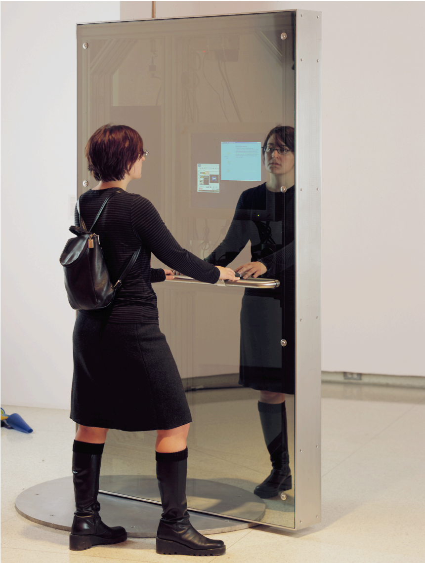
The portal designed by Antenna Design for Art Entertainment Network, Walker Art Center 2000.