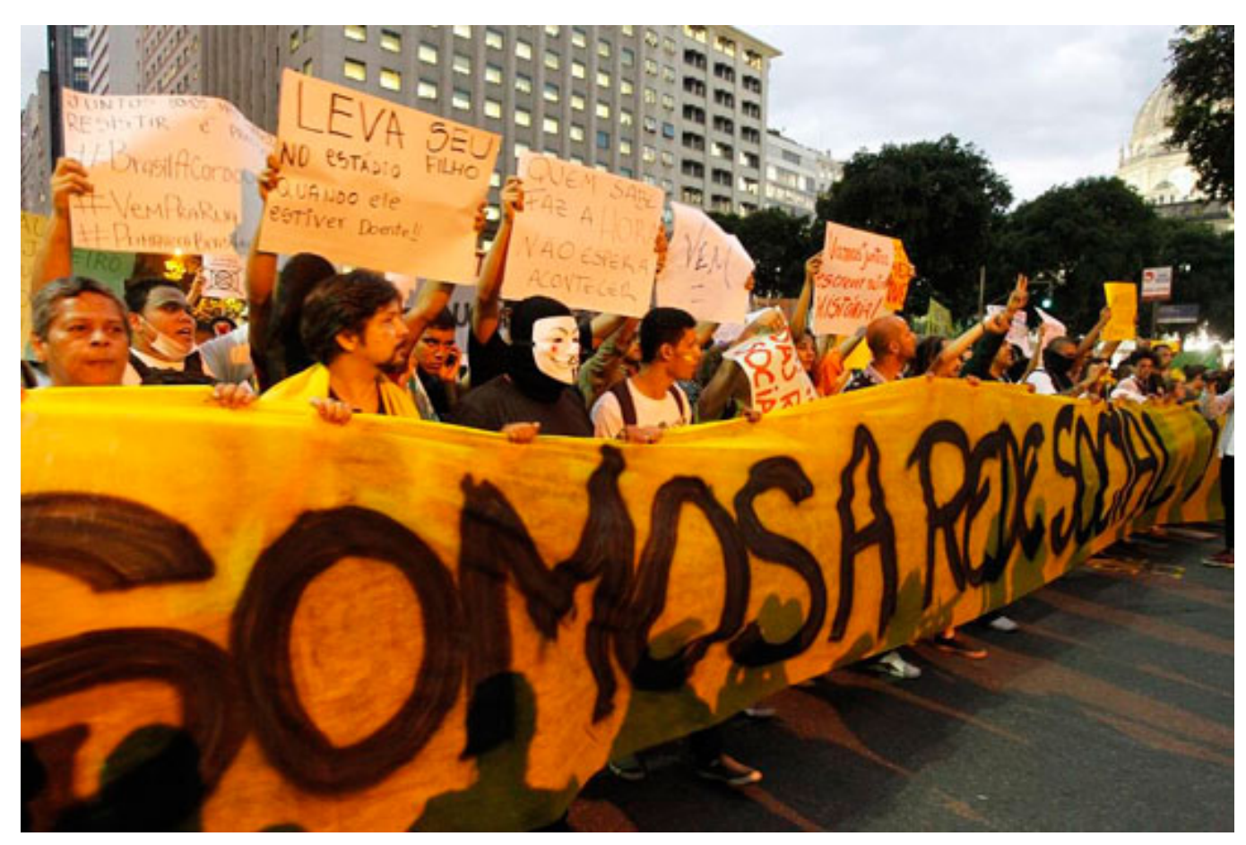
This protest banner in Rio de Janeiro from June 17 reads, "We are the social network!" See \rightarrow .